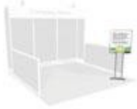
22" W x 28" H Vertical Sign w/ Sign Holder, Double Sided $299.50