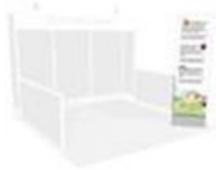
24"W Vertical Freestanding board, Single Sided $273.75