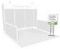
22" W x 28" H Vertical Sign w/ Sign Holder, Single Sided $232.75